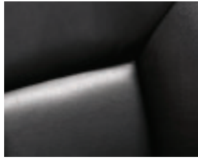
Leather-faced Off Black (B970)