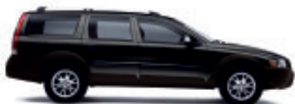
019 Black Stone

WITH A WIDE RANGE OF EXTERIOR COLOURS YOUR VOLVO XC70 CAN REFLECT YOUR PERSONAL TASTE.