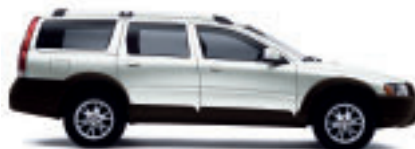
614 Ice White

The bumpers and wheel arch extensions are in stone grey or brown, depending on your choice of exterior colour – please see your dealer for details.