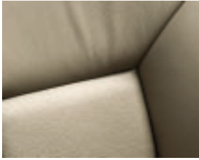
Leather-faced Oak (B980)