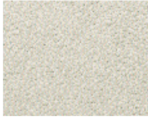
Leather-faced Arena (C981)