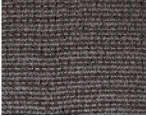
Siljan Textile/Vinyl Off Black (C070)