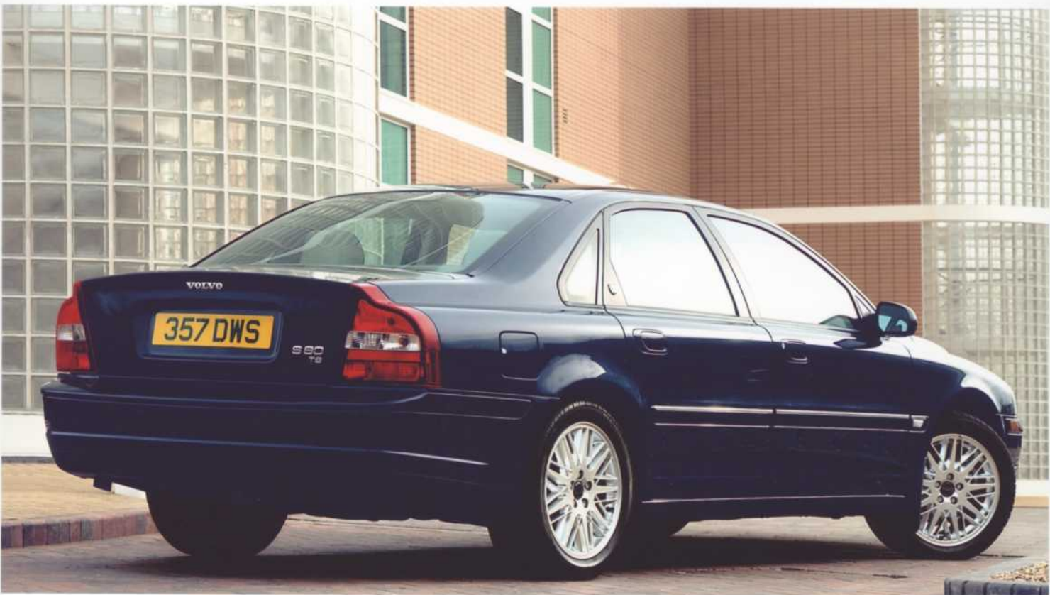
Volvo S80 Executive