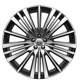
22" 20 Spoke (#800147)