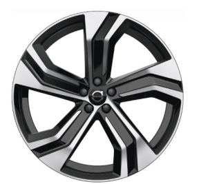
22" 5 Double Spoke (#1096)