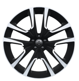
22" 5 Double Spoke (#800143)