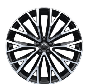
22" 10 Open Spoke (#800142)