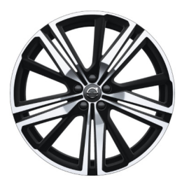
21" 5 Triple Spoke (#1013)