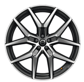
22" 5 Y Spoke (#1152)