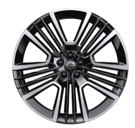
21" 5 Triple Open Spoke (#800141)