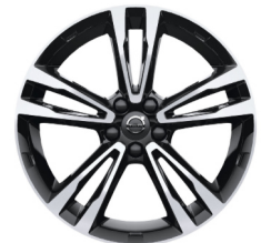
19" 5 Double Spoke (#224)