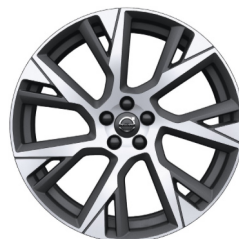
21" 7 Open Spoke (#800133)