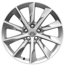
18" 10 Spoke Turbine (std. Momentum)