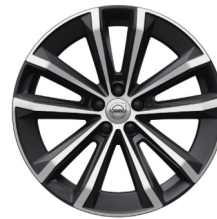
19" 5 Double Spoke (#1166)