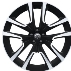
20" 5 Double Spoke (#800132)