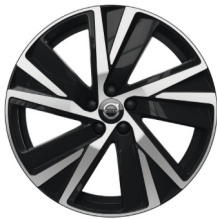
19" 5 Spoke (std. R-Design)