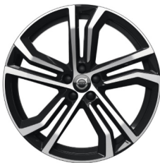
20" 5 Double Spoke (#1137)