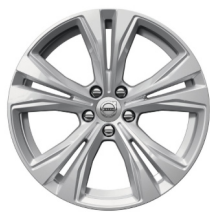
18" 5 Double Spoke (#1143)