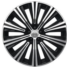
19" 10 Spoke (std. Inscription)