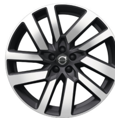
20" 5 V Spoke (#1167)