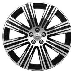
20" 8 Multi Spoke (#1139)