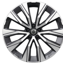
19" 6 Double Spoke (std. Cross Country)