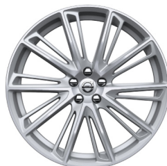
21" 10 Open Spoke Turbine (#800131)