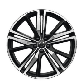
20" 5 Triple Spoke (#1052)