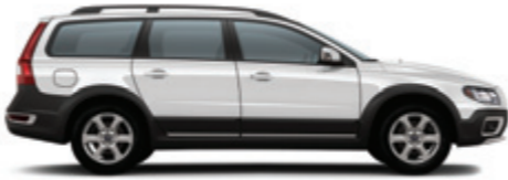
614 Ice White

All exterior colours come with Charcoal mouldings. It is not possible to reproduce exact original shades in printed matter. Please ask your Volvo dealer to show you samples.