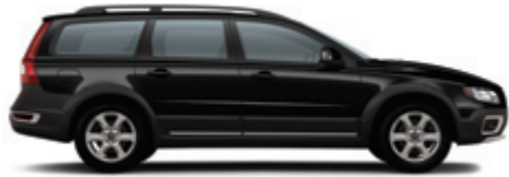
452 Black Sapphire metallic