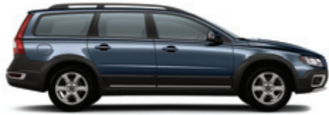
466 Barents Blue pearl