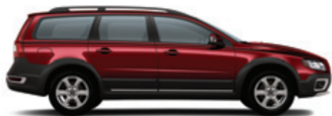
454 Ruby Red pearl