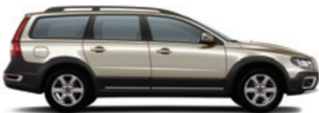
484 Seashell metallic