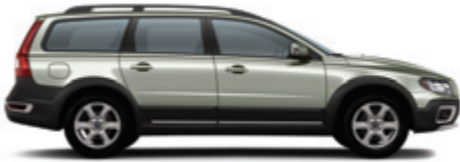
477 Inscription™ Electric Silver Coarse Flake metallic