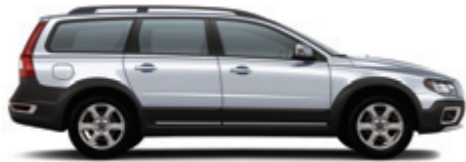
426 Silver metallic