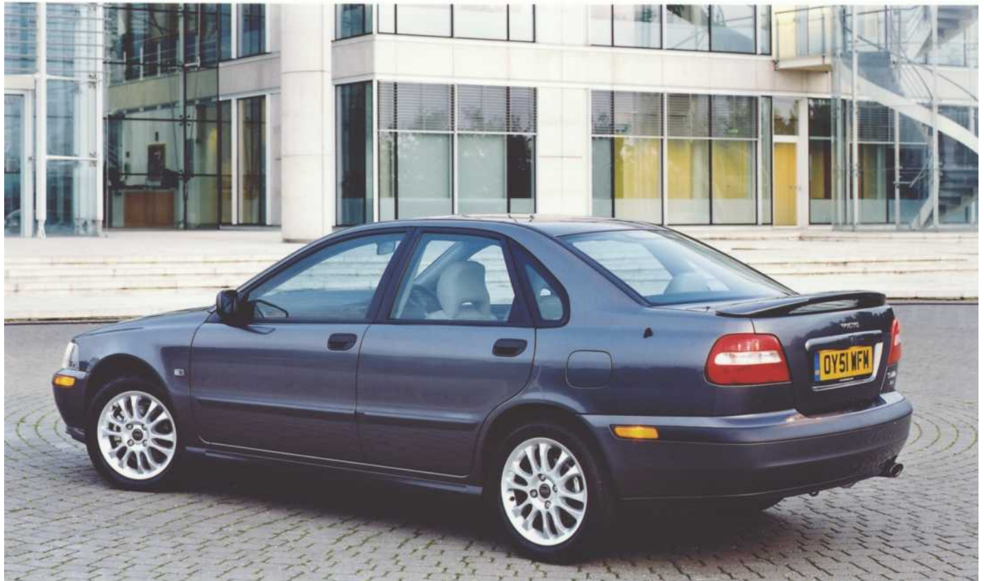
Volvo S40 October 2001