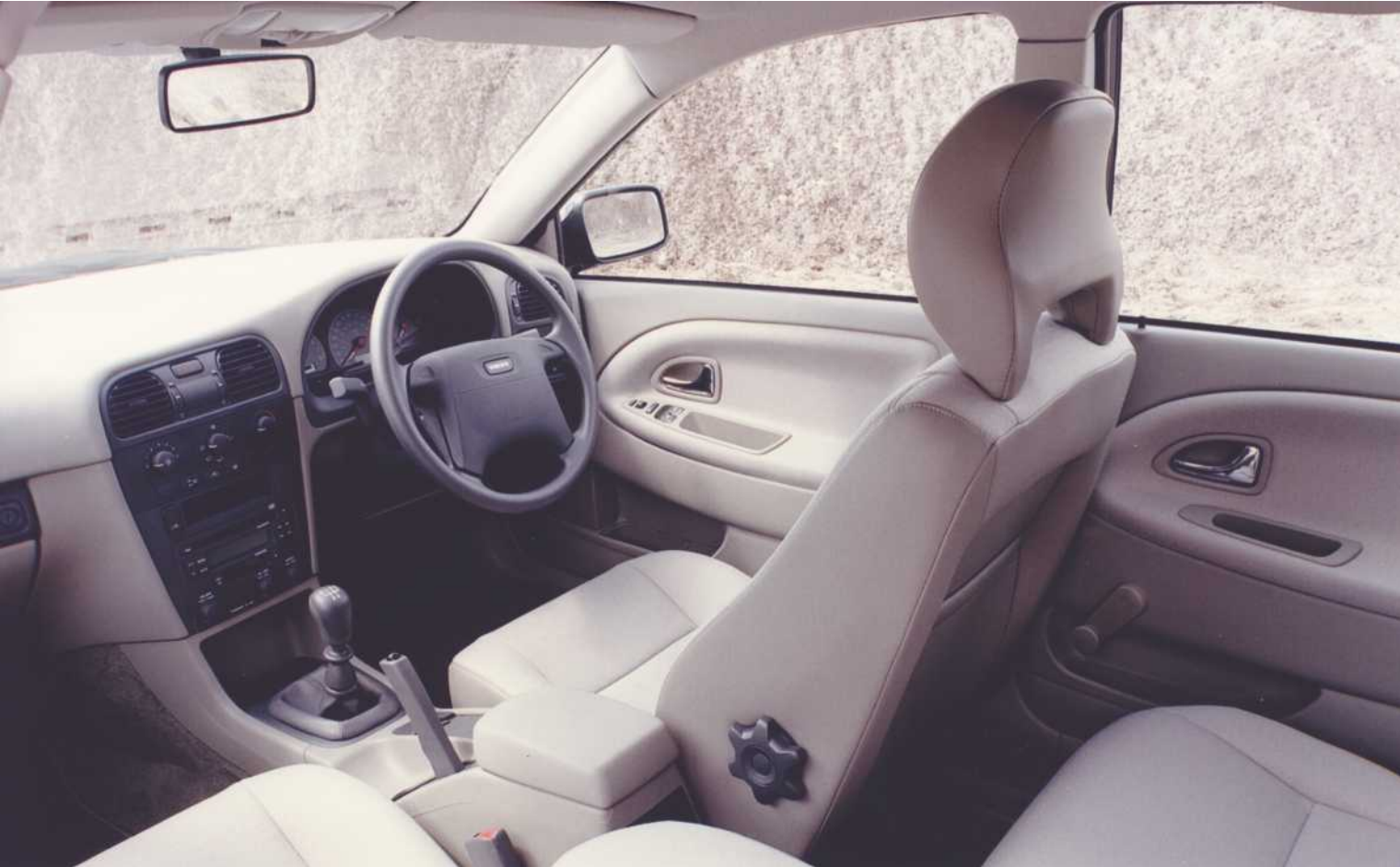
S40/V40 Phase II (July 2000)