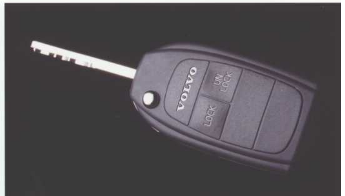
Volvo S40 Sport Lux - 2003 model May 2002