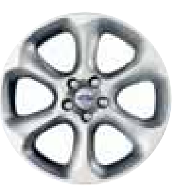
18" Notos (Silver Stone or Diamond Cut)* (XC90)

* Silver Stone wheels are available with Ocean Blue cars only; Diamond Cut wheels are available with Inscription™ Electric Silver Coarse Flake metallic cars only.