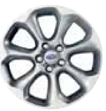
17" Pontos (Silver Stone or Diamond Cut)* (V70/XC70)

The Volvo Ocean Race Edition models come complete with stylish and unique Silver Stone or Diamond Cut alloy wheels, dependent on which exterior colour you choose. The Volvo V70 and XC70 models are equipped with 17" alloys, while the XC90 benefits from 18" alloy wheels, dramatically adding to the exterior styling of your choice of Volvo Ocean Race Edition.