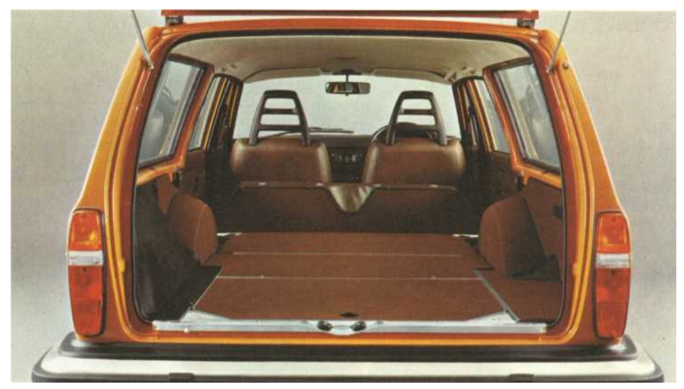
Just folding down the rear seat increases the cargo capacity from 53 cubic feet to almost 67 cubic feet. The tailgate opening is 45.7" wide and 30.7" high - room enough for a six-foot settee. A pressurized spring makes the tailgate easy to open and it is held up by means of a self-locking mechanism.

The Volvo 245 is powered by a new overhead camshaft 2.1 litre engine which develops 97 hp DIN or, the same engine with CI fuel injection developing 123 hp DIN. Either can be combined with a manual gearbox or automatic transmission.