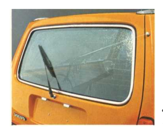
Seeing behind you is just as important as seeing ahead. Which is why the tailgate window of the Volvo 245 DL is heated electrically and has a wiper and washer.