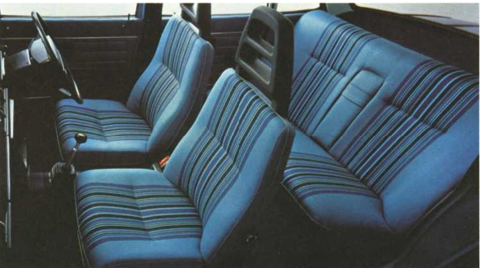
Volvo's new seats have integral type head restraints. The driving seat height is now instantly adjustable by means of levers.

The Volvo 244 GL is a really exceptional car, built for the man who seeks even greater comfort and performance. Under the bonnet is a new 2.1 litre engine with an overhead camshaft and CI fuel injection. It gives 123 hp DIN. Leather-faced seats, a sliding steel sunroof, tinted windows, a tachometer, manual gearbox with overdrive and an electrically heated driving seat are other features.