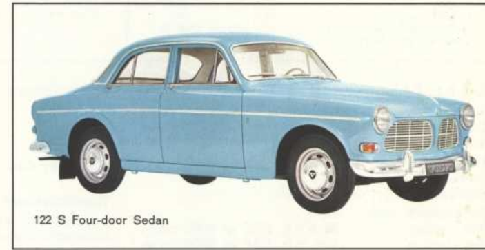
122 S Four-door Sedan