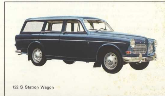
122 S Station Wagon