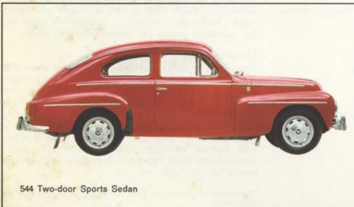
544 Two-door Sports Sedan