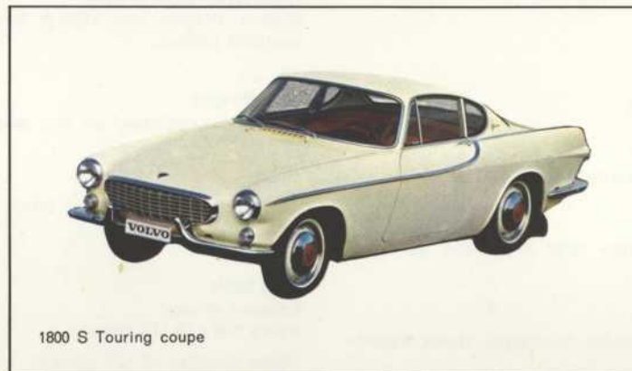
1800 S Touring coupe