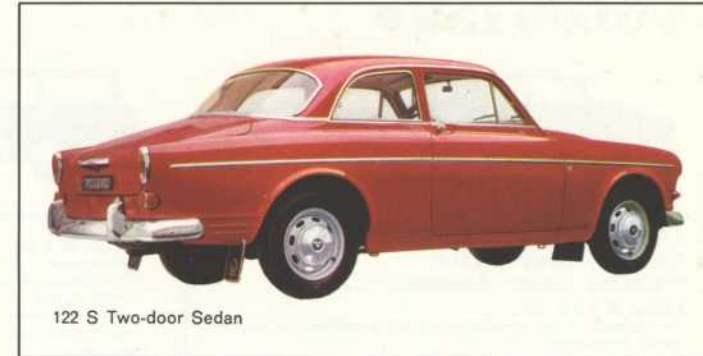
122 S Two-door Sedan