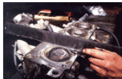
Fig 1. Check with a feeler gauge for warping between the surface and the straightedge.

Scrubbing is a common problem in a bi-metal engine, where two different metals are used for the cylinder head and engine block. The scrubbing action causes abrasion and shearing to the head gasket, which results in failure. Following the correct head bolt tightening sequence and applying the proper torque will help to minimize this effect.