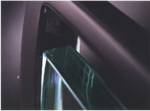
Strong side-window reinforcements