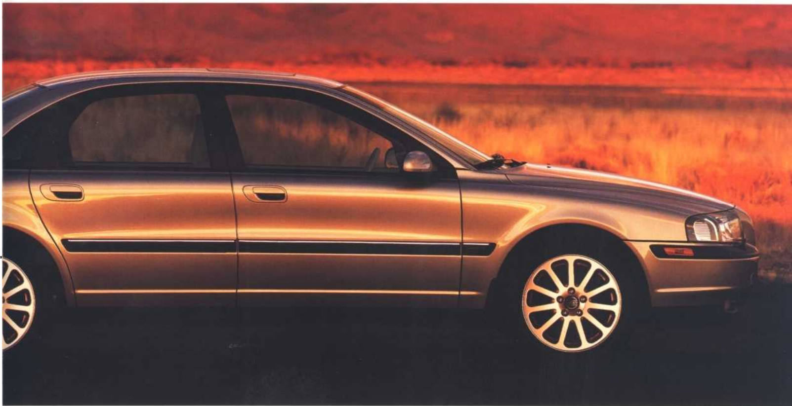
For more detailed armour specifications, please contact your Volvo dealer.