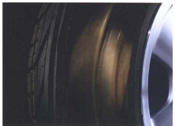
Run-flat tyres (optional)